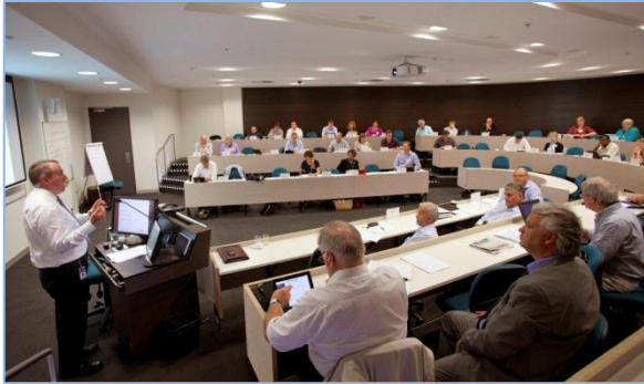
Participants at the ANZSOG-ACELG Excellence in Local Government Leadership Program